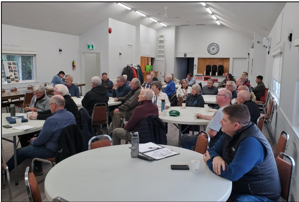
There was good attendance at the White Pine Award meeting in Elmvale.